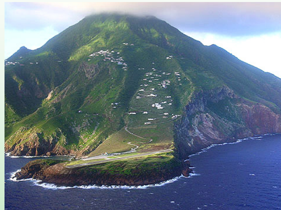
Want to know where this is? Unscramble number 6.