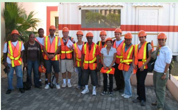
JGS Members visit Bouygues Construction