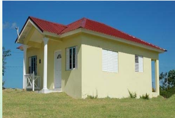
Sample unit at the National Housing Trust (NHT) scheme in Waterworks, Westmoreland.

The housing crisis is tied to the general credit crunch and recession of the United States markets. In the sub-prime market in particular, the impact of increasing property value between 2001 and 2002 allowed people to reduce their monthly mortgage payments with lower interest rates and withdraw equity from their homes as values