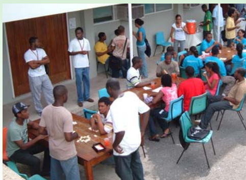
Students "converge" on the DoGG parking lot.