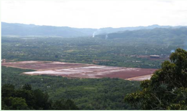
Disturbed land: the "red mud" at Ewarton Works.

If Professor Lalor points today to the global consequences of global warming, Professor Girvan pointed back then to the local consequences of Jamaica's model of industrialisation without conservation. Intensive natural resource exploitation has led to an increased rate of resource depletion in the process of material accumulation by companies in bauxite, tourism and petroleum