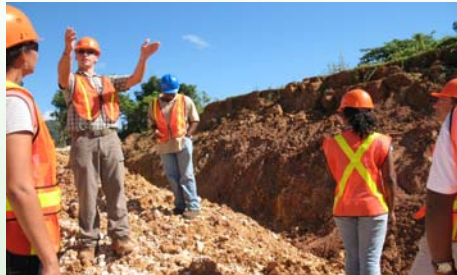
JGS members visit a highway construction site near Linstead.

Mount Rosser Bypass Field Trip. Early in the morning of Saturday, November 29, 2008, 13 lucky souls set out to preview one