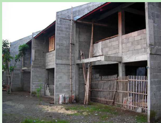
Housing constructed by the Philippines Homeless People's Federation, Iloilo City, Philippines.

"Going to scale" requires at least two different interventions. The first is identifying adequate sources of financing –