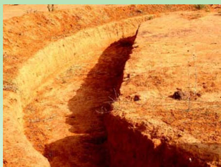
Infiltration channels, Thies Region, Senegal

of scales. The development of a capitalist economy dependent on the industrial use of fossil fuels in the eighteenth and nineteenth centuries simultaneously created new structures of social life and