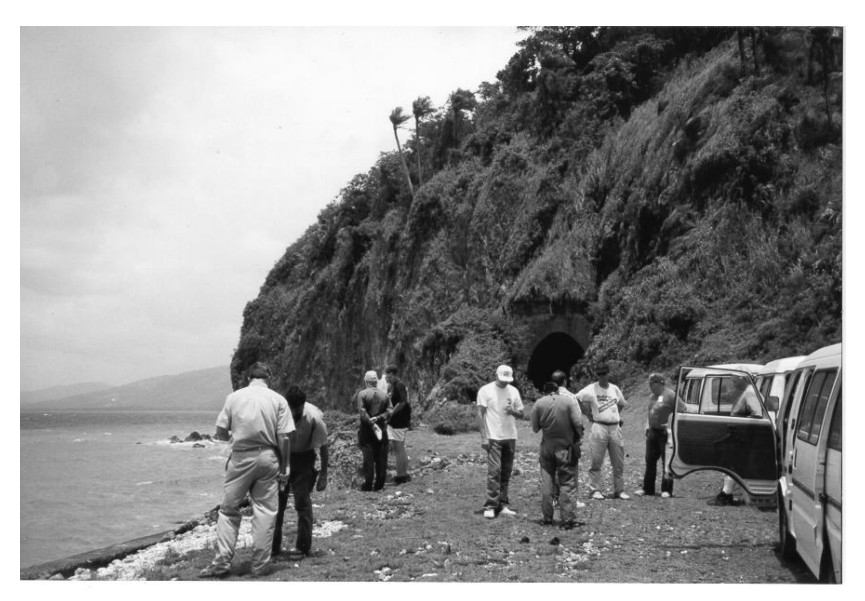
Figure 1. Participants, on the second day of the pre-conference field trip, enjoying a refreshment break before examining the Neogene Low Layton pillow lavas (background) that crop out along the north coast. The photograph shows the western entrance of the old railway tunnel.

At a meeting of the Permanent Standing Committee of the CGC it was agreed that the next meeting in 2001 should be held in Costa Rica, with Barbados and Venezuela as possible alternative sites. Chairman of the Permanent Standing Committee G. Draper reported that there was now a Caribbean Geology web site (http://www.fiu.edu/orgs/caribgeol/) where interested geoscientists could access the latest Caribbean information.