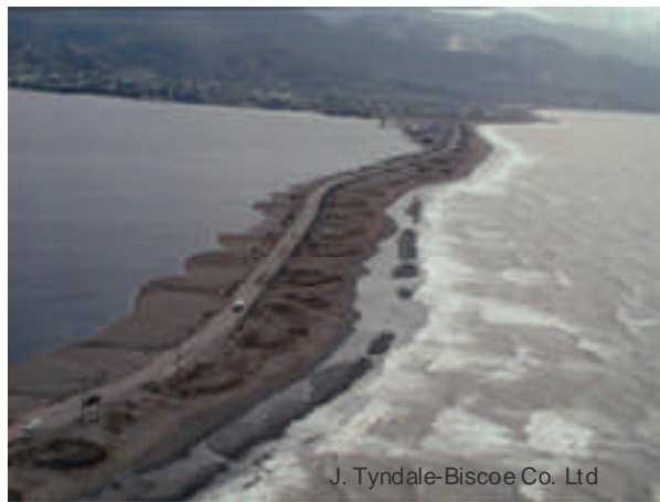
The Palisadoes: post-Hurricane Ivan 2004. New beaches on the left (harbour) side

In the wake of the passage of Hurricane Ivan on the weekend of September 11 th , 2004, many people have raised concerns about the viability of the Palisadoes road as a reliable, all weather access to the Norman Manley airport. By the end of Ivan's passage, among other effects, it had completely blocked the road from Kingston to the airport with sand and stones and, at the height of its passage, raised a storm surge that completely overrode large sections of the eastern part of the Palisadoes, depositing the "new beach" debris fans into the harbour. So, as the waves covered sections of the road, for a few hours, the Palisadoes became an island. Only the other day waves, pushed by strong winds and high tides, overwashed the narrowest part of the peninsula again, moving sand and stones from the bank at the roadside, leaving debris scattered across the road. For some observers these events beg the questions: "Was the Palisadoes ever an island? Will it become one in the future? Will further erosion breach the Palisadoes for good and prevent access to the airport"? The following account should help readers to answer these questions.