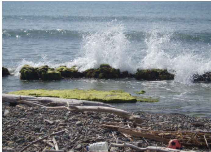
Beach Rock on the Palisadoes

The westernmost breach of the five appears to have been the most serious one. It persisted for some time and was reopened as late as 1782. Its site today is at one of the narrowest parts of the Palisadoes. A series of groynes was constructed here in the 1950s, but are now in a very poor state of repair. The washover that occurred on July 7 th , 2006 almost exactly marks the spot of that fifth breach. If the 1722 hurricane put 5 metres of water in Port Royal, where wave energies are comparatively low and there is some reef protection, even from the south, it is not surprising that the eastern Palisadoes had holes eroded in it.