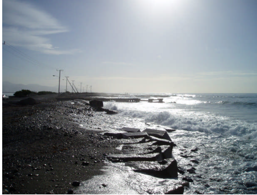
Palisadoes groyne: breaking waves and structural mitigation

This movement of sediment from east to west does not occur at a steady pace. During stormy periods the energy of large breaking waves is able to move large sized pebbles and boulders, whereas in times of calm seas longshore movement of sand predominates and the whole process of transport along the shore is slower. On stretches such as that fronting the airport, the waves approach the beach and carry sediments in and out at right angles to the shore. Along here too the wind has generated sand dunes that were up to 5 or 6 metres high before Hurricane Ivan.