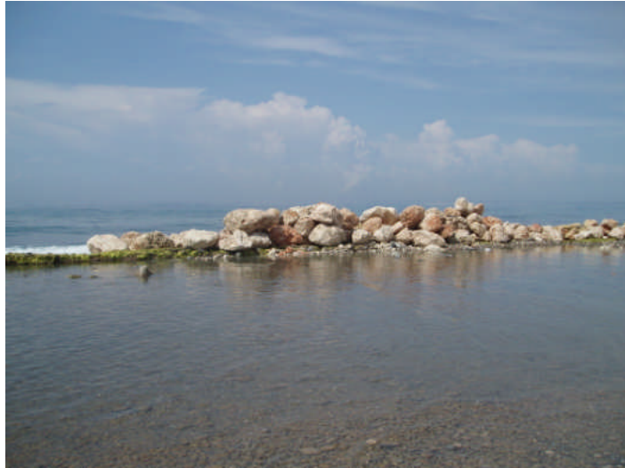
Limestone boulders placed on beach rock (at far left) at the Palisadoes narrow spot

temporary, because there is ample evidence from other sites we have surveyed along the Jamaican coastline that a storm equal in intensity to Ivan would probably move many of those boulders and put them right in the middle of the roadway.