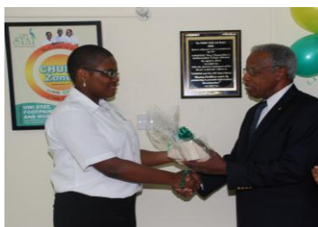
The Chancellor Sir George Alleyne making a presentation to a UWISTAT Ambassador in Chudy Zone

The Library partnered with the Vice Chancellor's Ambassador Corp, UWISTAT (UWI Students Today, Alumni Tomorrow) to repurpose a small space in the Main Library for engaging the student body in the activities of the Corp. The space, which the Ambassadors named Chudy Zone (Chill and Study Zone) will be maintained by UWISTAT in collaboration with the Library. Chudy Zone will not only allow UWISTAT Ambassadors to promote "Pelican Pride", but will also expose students to the CARICOM Skills Certificate, various displays to promote The UWI Alumni Association, as well as other UWISTAT initiatives. Additionally, UWISTAT Ambassadors will be available in the area for one-on-one discussions with their fellow students. The Vice Chancellor officially launched Chudy Zone on April 4, 2013 while The Chancellor visited the area and unveiled the Chudy Zone plaque on April 19, 2013.