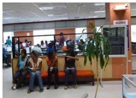
Refurbished Waiting Area - Science Branch Library