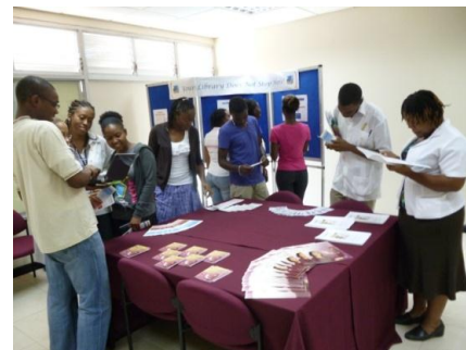
Students at the E-Resources Fair, 2013