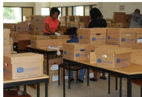
Staff and student assistants sorting the IMF Collection

The Library received 1412 boxes of legal material from The IMF, Washington D.C. Office. The Library made a bid for the collection and was selected from among a list of several applicants. The items from the gift are primarily Law Journals many of which will be new to the Library's collection.