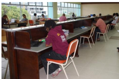
New Second Floor Reading Room - Medical Branch Library