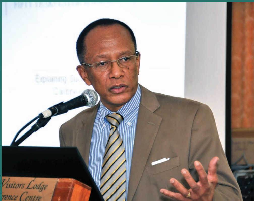
Professor Orlando Patterson making a presentation at the special UWI Homecoming 2012 luncheon, held in celebration of the UWI's and Jamaica's 50th Anniversary.

On March 6, 2012 the UWI, Mona Campus hosted His Royal Highness Prince Henry of Wales, popularly known as Prince Harry. The visit formed part of official celebrations by the British Monarchy in commemoration of the Diamond Jubilee of Her Majesty, The Queen, on the 60th anniversary of her coronation as Queen of England. During his visit, Prince Harry toured facilities at the Mona Bowl for Sporting Excellence, interacting with the Hon Usain Bolt and other athletes from the Racers Track Club and UWI, Mona track team, as well as students from schools in the surrounding communities.