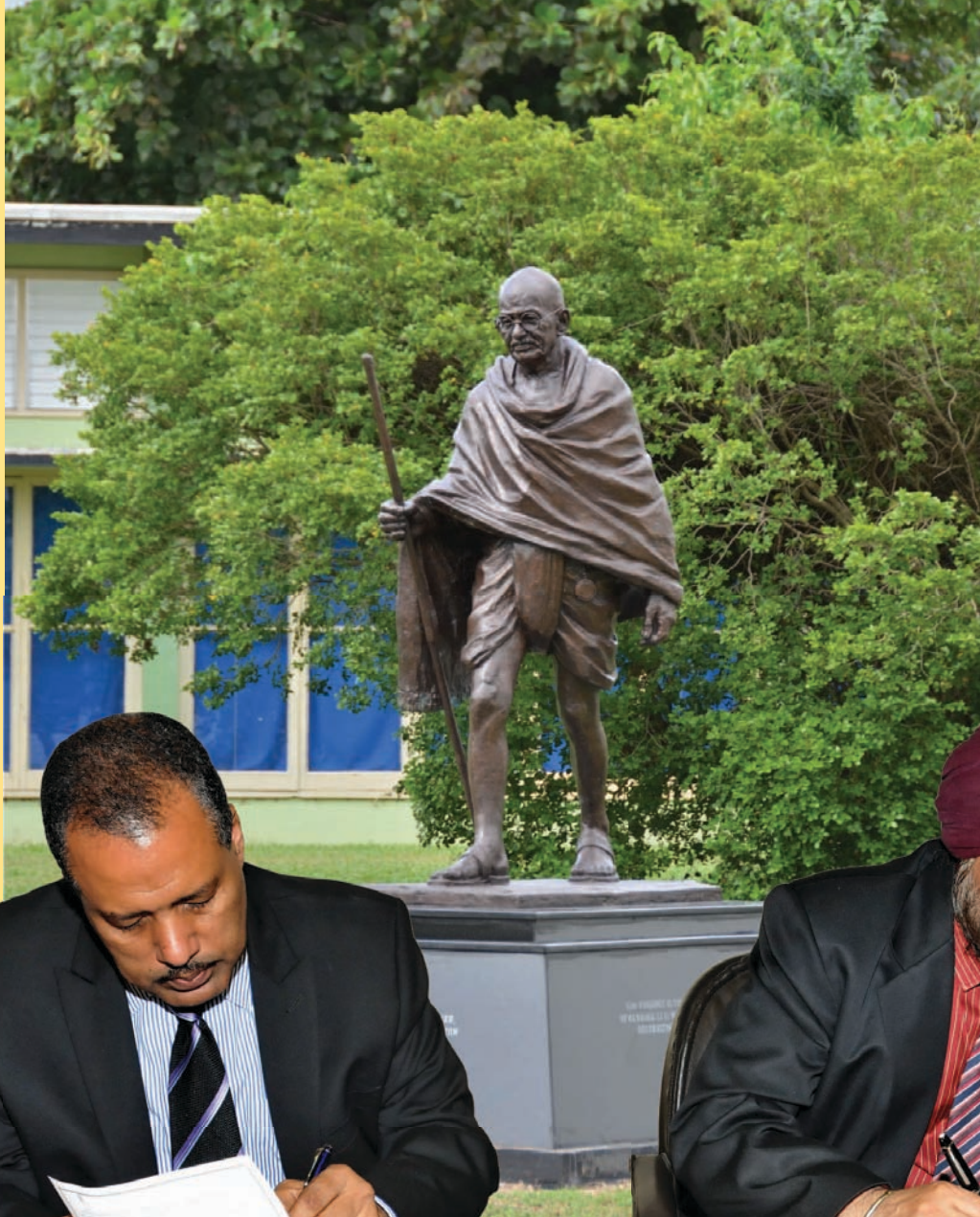
Statue of Mahatma Gandhi - a gift to the UWI from the people of India