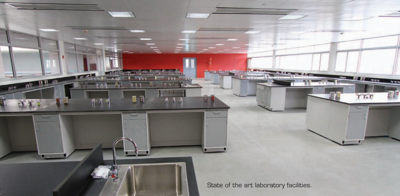
State of the art laboratory facilities.

The Faculty of Medical Sciences Teaching and Research Complex, near the hospital entrance to the campus is as striking inside as it is remarkable outside. Easily the most physically imposing new building at Mona it stands on seven levels, with 250,000 of its 300,000 square feet complete.