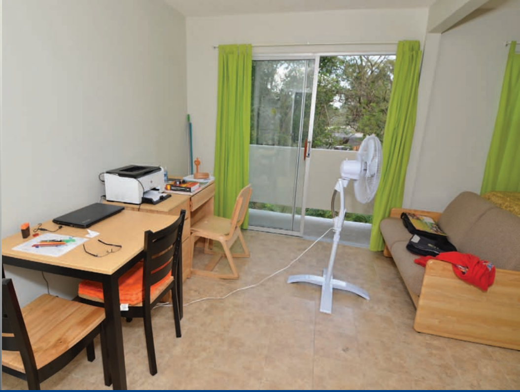
Inside a super studio unit at the new graduate students' housing complex.

terms of its research profile. Blocks A and C, which were completed for the new school year, were fully occupied at the time of preparation of this report. Block B, which was slated for handover soon thereafter, had 50% confirmed applications.