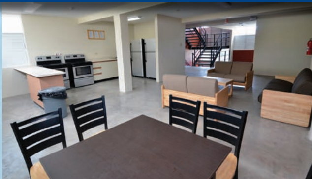
Common area on each floor, on each block includes a kitchen and lounge area that serves 22 residents.

Another pioneering collaboration with the NHT, the hall goes a far way to meeting the consistently high demand for housing on the campus. The rates are highly competitive to the open market and we are satisfied that the quality offering is vastly superior to what students have to contend with at significantly higher prices.