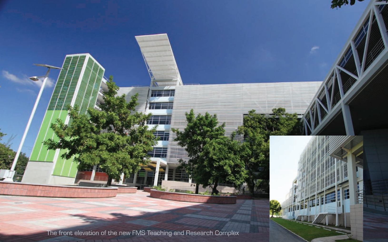
The front elevation of the new FMS Teaching and Research Complex