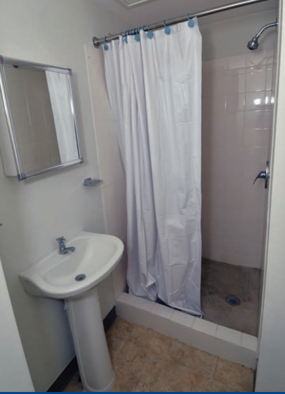
Bathroom facility in each apartment