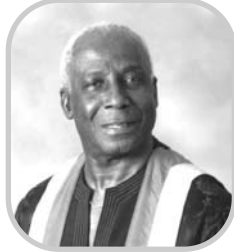
Prof. Rex Nettleford Vice Chancellor