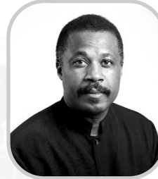
Professor Hilary Beckles Pro Vice Chancellor and Principal Cave Hill