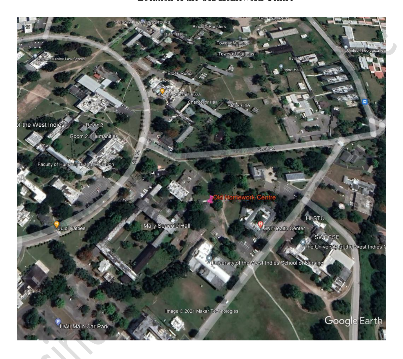
Appendix I Location of the Old Homework Centre