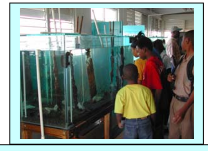
Posters and curated material viewed by visitors to the Port Royal Marine Lab.

The documentation of the biodiversity and production of field guides and other material for use in public education has been achieved. Copies of the 7-volume field guide can be obtained on waterproof paper as well as in interactive CD-Rom format.