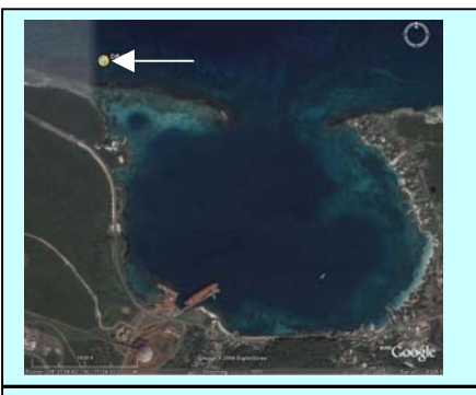
Satellite image showing the location of the CREWS station at Discovery Bay.

This project has been supported through the MACC project, the Caribbean Community Climate Change Centre, World Bank/GEF, CARICOM, the University of the West Indies, NOAA and University of Miami/Rosenstiel School for Marine and Atmospheric Sciences.