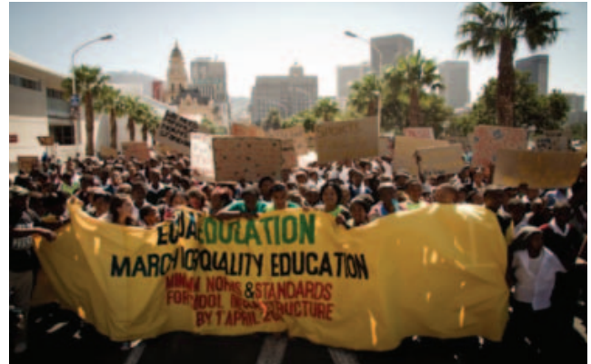
Image 3: 20,000 Equal Education activists march on Parliament on Human Rights Day, 2011.

Many parents have experienced negative or harmful school environments, having been educated under Bantu Education. These parents often felt intimidated and were less aware of what to expect from schools and government. To develop understanding of educational issues among parents and to encourage their support and action, Equal Education has run educational workshops with parents and involved them in campaigns, advocacy work and school based projects, such as supervised after-school homework classes.