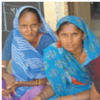
Blue sari mother.

"I am very puzzled," I continued. "Why is it that even though you are illiterate you know exactly what you need to do when a child has fever, but when it comes to her schooling you don't do anything when she cannot read?" The blue sari mother was ready with her answer. "That is very simple," she explained. "We go to the doctor only sometimes; only when there is problem. Not every day. It is not the doctor's job to come and take care of my children. I have to