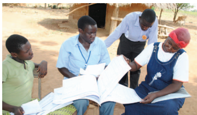
Volunteers, Kumi district, Uganda.