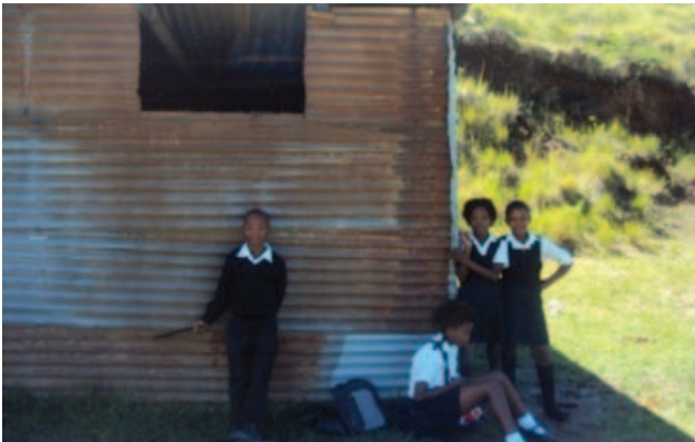
Image 2: Students outside their Junior Secondary School in South Africa.

Equalizers, EE's most active members, are at the center of much of its work. These high school students are from predominantly poor and working class areas. They engage with the organization through a variety of activities ranging from weekly youth groups, mass meetings, camps and marches. Equalizers play a leading role in the activities of the organization. They work with EE, along with parents, teachers, activists, and community members, to improve schools in their communities. They set an example to their peers through their dedication to their own education, and in addition to boosting EE's growing youth support, has helped to mobilize the support of parents and communities. Parent networks ensure that parents are informed and given a platform to support the advancement of equal and quality education in South Africa.