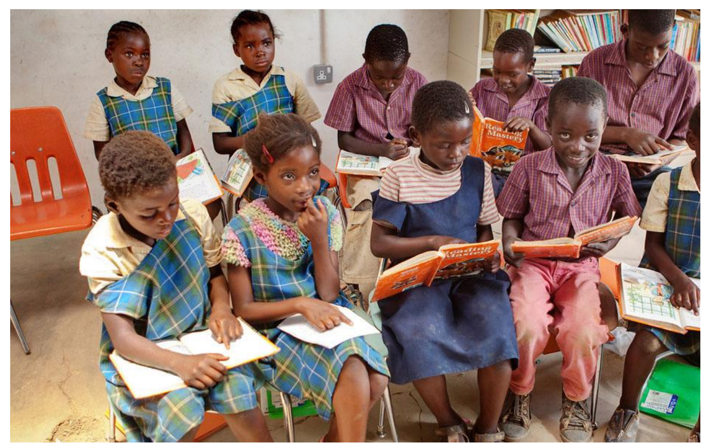
Zambia: Children from Mother's without Borders School reading together in class