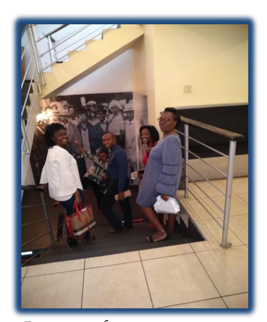
En vogue on the runway