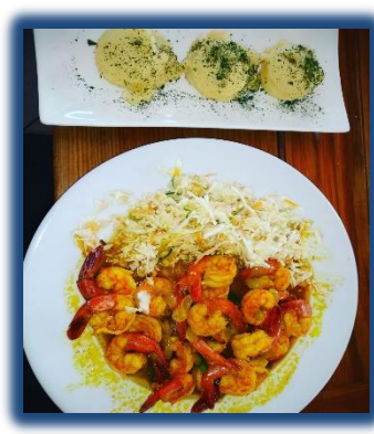
What a dish "curried shrimp"