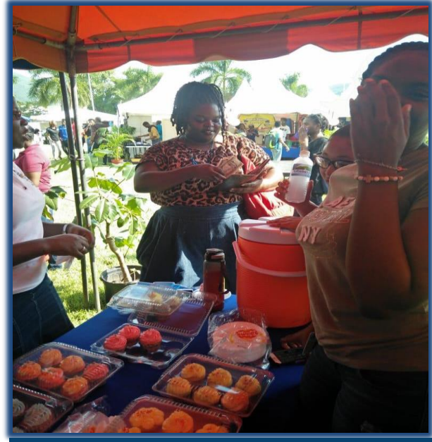
Sale Out!!at Club Fusion 2018