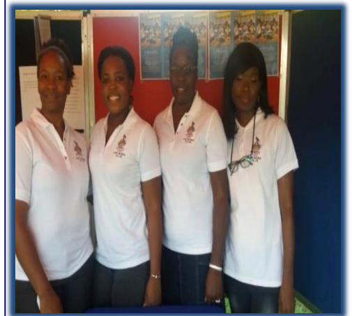
Members of the Executive