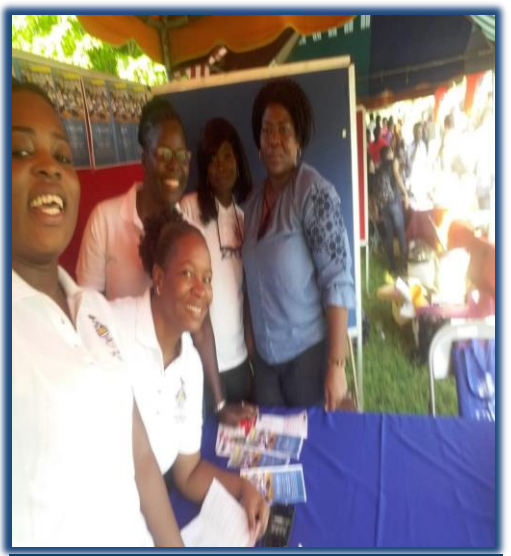
Sale Out!!at Club Fusion 2018

"When all is done, we can still have fun!!"