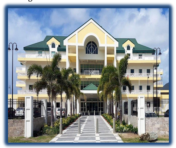
New Government Administration building of Sint Maarten

"Experiencing the, "Regional Approaches to Disaster Recovery and Heritage Preservation" conference has led me to have a greater appreciation of not only archival materials and their value, but also of other related fields such as archaeology and intangible cultural heritage."