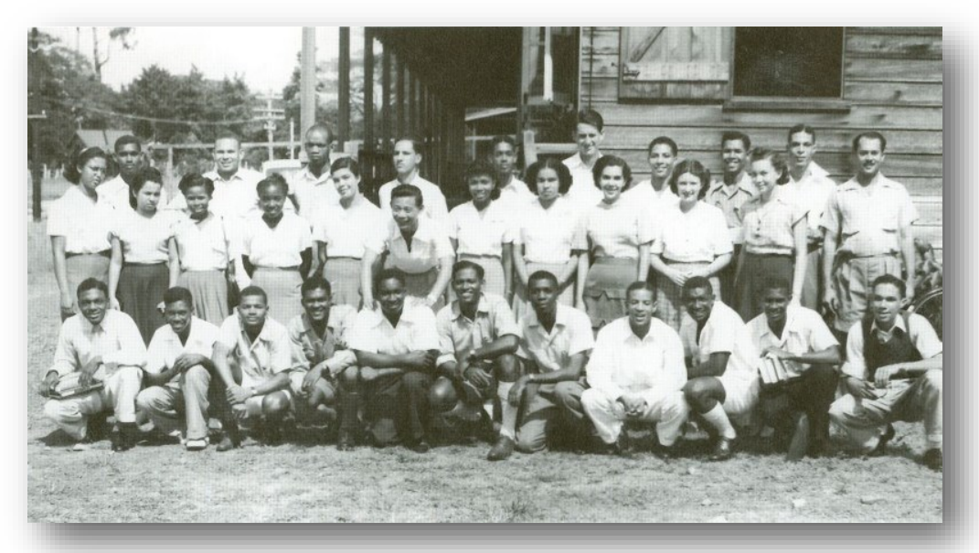
The first batch of medical students outside Gibraltar Hall, Mona, Jamaica (1948)