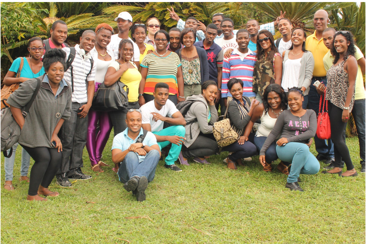
Annual Graduate Picnic (October 31, 2014)