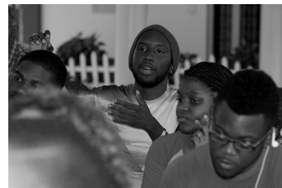
Students during the Q&A