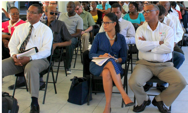
Audience (Telecommunications Public Forum)