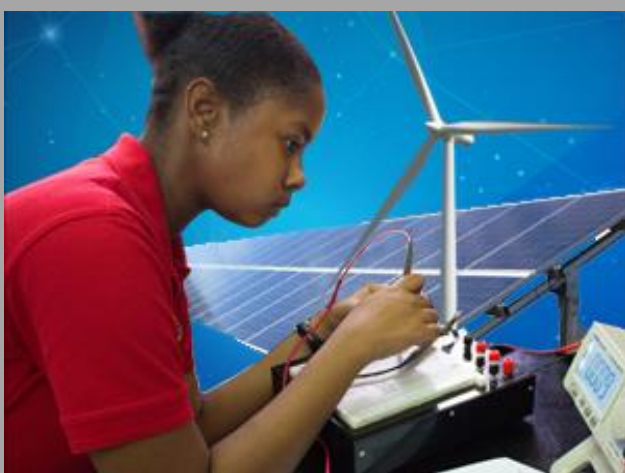
Electrical Power Engineering