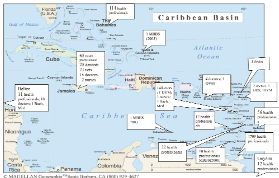
*Map of the Caribbean showing total number of graduates in each territory

21 St Lucia, eight St Vincent. Trinidad and Tobago had 956 trained doctors.