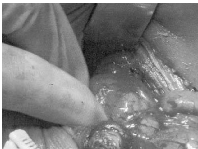
Fig. 2: Preduodenal portal vein compressing duodenum.

obstructing PDPV was bypassed by constructing a side-to-side duodeno-duodenostomy between dilated and collapsed duodenum.