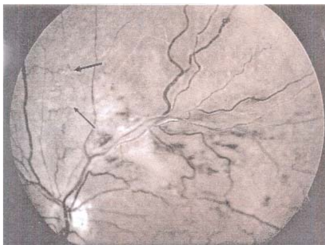
Fig. 2: Red free photograph showing collateral circulation indicated by black arrows.

velopment has been noted and these may occur at the optic disc or intraretinal; their absence has been implicated in persistent exudation (2, 3). Exudative retinal detachment has been noted to be more common in CRVO affecting the younger age group (average age 25 years) characteristically presenting with associated oedema and haemorrhage in the macular area (4).