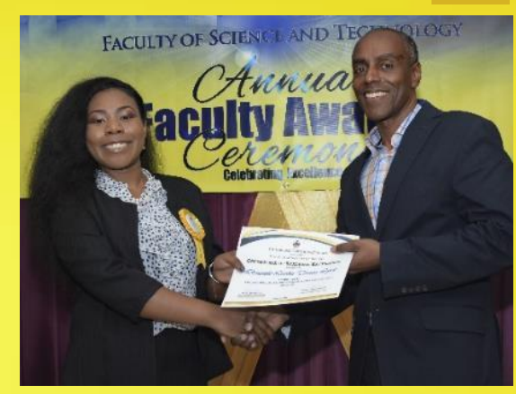
SELECTED 2019 Awardees