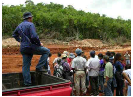
The president surveys the troops

http://gsj.monainformatixltd.com/latest.html