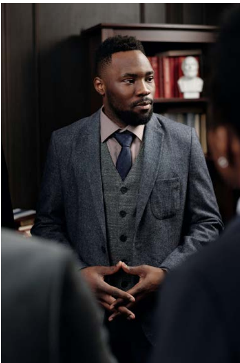
Carlton Lowrie Debating and Oratorical Society

The First Year Experience Programme (FYE) is a year long programme designed to support first year student success. Follow the page at this link https://instagram.com/uwimonafye?igshid=12eys1mhgxyz