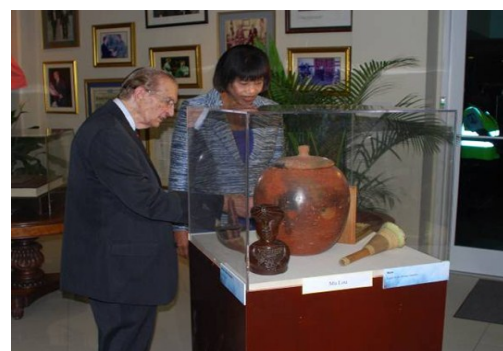
The Most Hon. Edward Seaga points out specific details regarding one of the pieces comprising the exhibition mounted at the Handover Ceremony for the Edward Seaga Collection to The Most Hon. Portia Simpson Miller, Prime Minister of Jamaica.