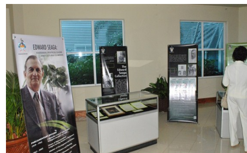
Guest viewing part of the exhibition mounted at the Handover Ceremony for the Edward Seaga Collection