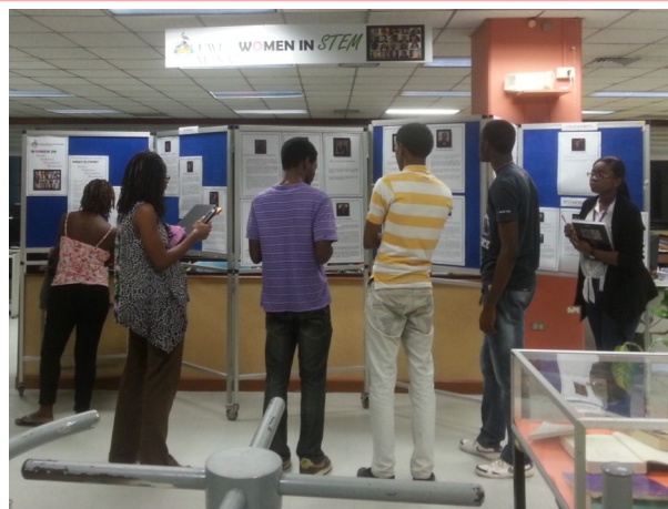
Students viewing the exhibition

This exhibition drew the attention of faculty and students and received excellent comments from both. The majority of the comments focused on how the exhibition helped viewers to see the sterling contribution and dedication of these women to STEM and the inspiration and motivation gained from their hard work. Others focused on the understanding of the STEM concept and the types of jobs available to them. A student in Biochemistry remarked "Very good display. Empowers me as a female to spread my wings to new horizons knowing that persons i.e. females have achieved greatness in sciences. Allows me to focus on the fact that if they did, I too can do it" . Dr. Donna Minott-Kates, lecturer from the Chemistry Department stated, "It is very good to see a synopsis of the work of [myself and] my colleagues in one place" . This exhibition provided a glimpse of the huge intellectual potential resident in S&T at UWI". We invite you to view the exhibition online at our website : http://www.mona.uwi.edu/library/