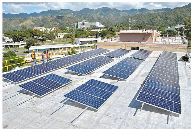
Solar Arrays Installed on the Roof of the SEBL, January 2019