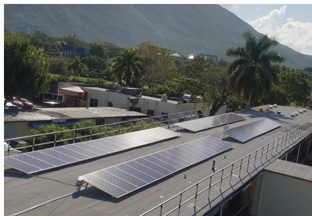
Solar Arrays Installed on the Roof of the Physics Lab, February 2019