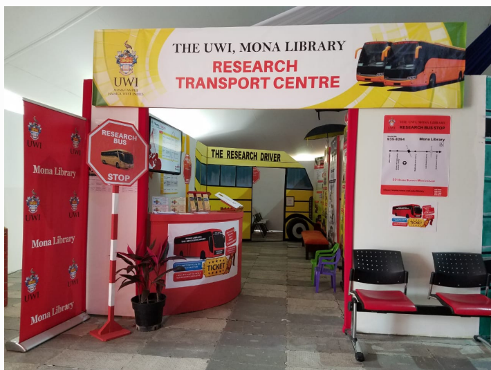
Entrance to the Mona Library booth