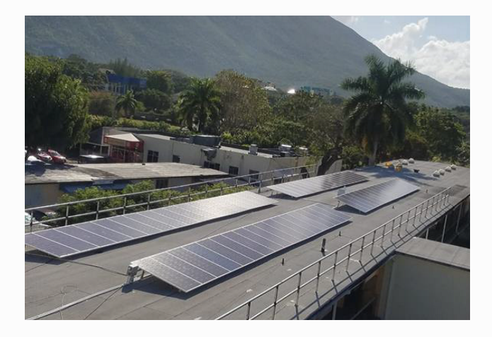
Solar Arrays Installed on the Roof of the Physics Lab, February 2019