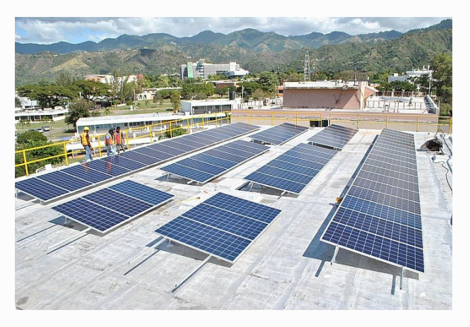
Solar Arrays Installed on the Roof of the SEBL, January 2019