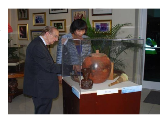
The Most Hon. Edward Seaga points out specific details regarding one of the pieces comprising the exhibition mounted at the Handover Ceremony for the Edward Seaga Collection to The Most Hon. Portia Simpson Miller, Prime Minister of Jamaica.