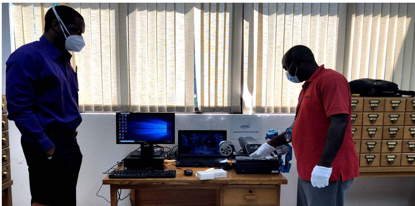
“The team from Jamaica Microfilm demonstrating the use of the Microfilm Scanner.”