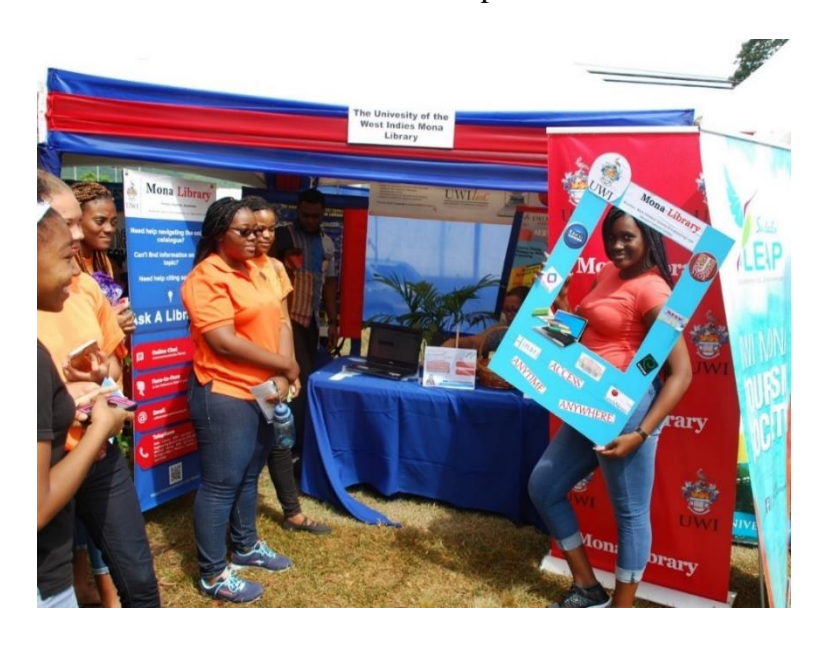
Students visiting the Library's Booth at the Orientation Village

The general orientation of undergraduates at the Mona Campus was held on August 23 and 24, 2018. The Library's activities for orientation included, a booth at the UWI Mona Orientation Village; a treasure hunt in all libraries; library tours; welcoming décor in the Main and branches; UWILinC sessions for one week; and Hall of Residence Librarian presentations to first year students on halls over an extended period. The orientation of postgraduates took place August 31, 2018 at which they were informed of the Library's services and facilities and which was a huge success. The WJC Branch also participated in orientation activities at the WJC Campus.