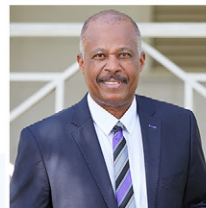
Prof. Sir Hilary Beckles World renowned Historian and Vice Chancellor, The University of the West Indies