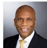
Bishop Tedroy Powell National Presiding Bishop, Church of God of Prophecy Trust (UK)