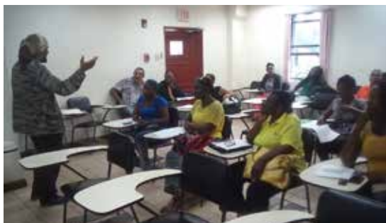
Sensitization Session at the Mona School of Business and Management for a cohort of COMETII Participants

Fifteen organisations participated in the training for the final cohort of 2016/2017, including: Race Course PYC (Clarendon), The Jamaica Association of General Baptists (Clarendon), Beulah Church of God Seventh Day Evangelical Inc. Ltd (Clarendon), Mocho Citizens Association (Clarendon), Mighty Gully Sculptures (St. Catherine), Good Hope Partners (St. Andrew), East Kingston Society (St. Andrew), Barrett Town Police Youth Club (St. James), Lilliput Rovers Youth Club (St. James), Ramble Hill Citizens Association (St. James), Mt. Carey Citizens Association (St. James), Race Course CDC (Clarendon), Belle Plain Citizens Association (Clarendon), Brixton Hill CDC (Clarendon), Knollis Community Benevolent Society (St. Catherine).