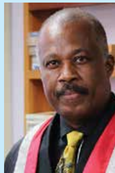
Professor Sir Hilary Beckles Vice Chancellor Personal Office of the Vice Chancellor The University of the West Indies