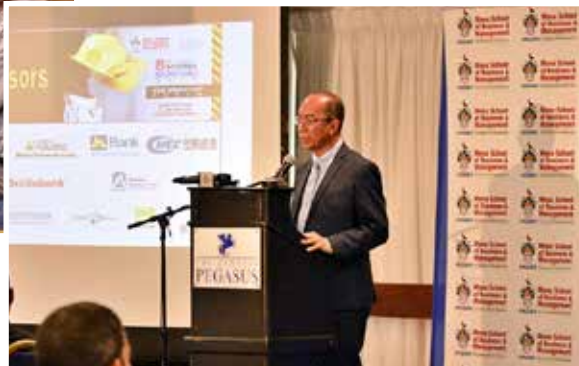
The Honourable Dr Horace Chang, Minister without Portfolio, Ministry of Economic Growth & Job Creation addresses MSBM RT2017