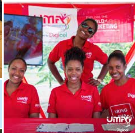
UMA at Orientation last year