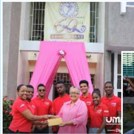
UMA Exec donating proceeds from the 6-A-Side Football competition to the Jamaica Cancer Society