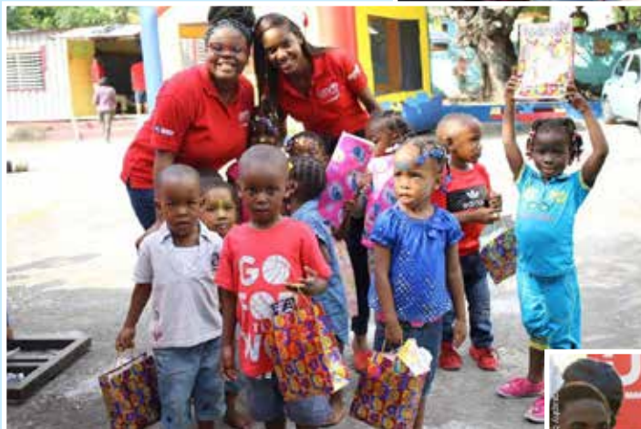
UMA Christmas Treat at Kintyre Basic in Papine