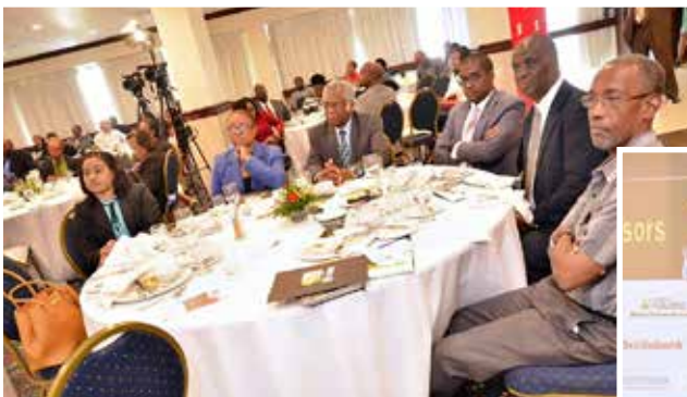
A section of the audience at the MSBM RT 2017 listens intently to a presentation.