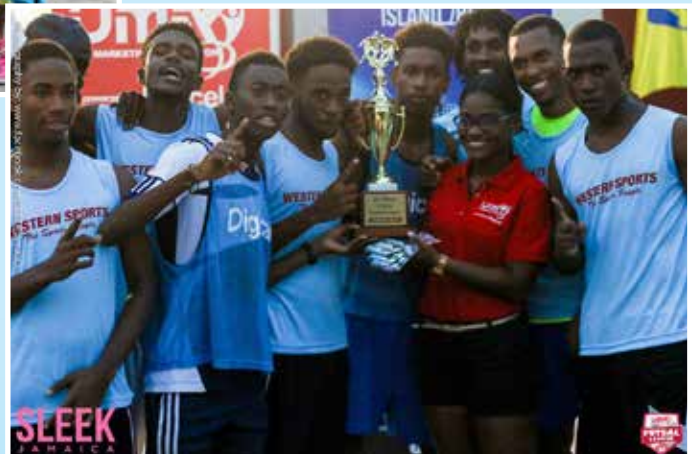
Past UMA President presenting trophy to winners of the 6-a-side futsal in aid of breast cancer awareness