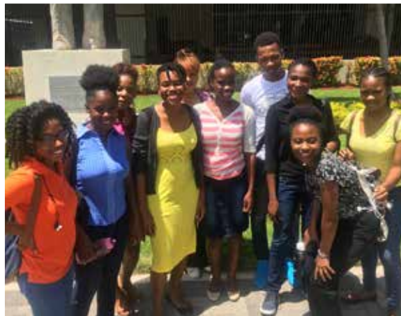
Cooperative in Accounting students on a field trip to the Bank of Jamaica.

In the period under review, 70 cooperative accounting students were placed on internships with Ernst and Young (EY) and PricewaterhouseCoopers. The majority were placed with EY. Their internships ended in April 2017 and they returned to the Campus and successfully completed all their summer courses with a 100% pass rate. The 21 final year students in the programme will graduate – seven with first class honours, and 14 with second class honours. Eleven of those 21 students have been accepted to pursue the MSc in Accounting full-time and the others are all employed. The 2016/17 Cooperative Accounting programme has seen a 210% increase in the number of students going to the USA on internship at EY. There are currently 70 interns in the programme - 16 MSc in Accounting students and 54 undergraduate Accounting Major students.