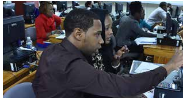
Participants work in teams at the Bourse Game Treasury Management Simulation Workshop

The PSU delivered customized training to employees of twelve (12) private and public sector organizations. A total of 279 participants representing 18 cohorts were trained in the following areas: Current Issues in Banking (Middle Management Development); Current Issues in Banking (Executive- Level Development); Leadership Development ; Essentials of Project Management ; Introduction to Project Management ; Principles & Practices of Project Management ; Effective Strategic Thinking & Critical Analysis ; Effective Business Writing ; Human Resource Management and Employment