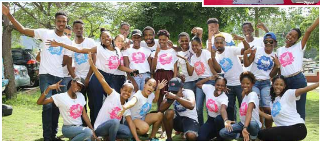
UMA promoting staple event- college cooler fete, which funds a marketing grant for deserving students