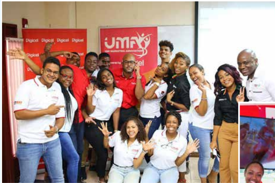
UMA Exec with Title Sponsor Digicel