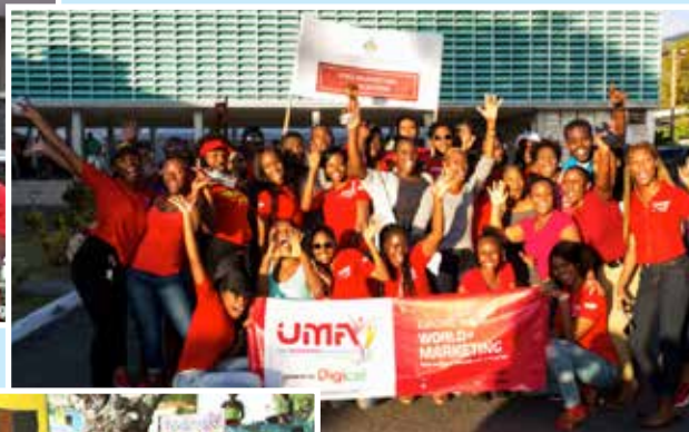
UMA participating in UWI Homecoming