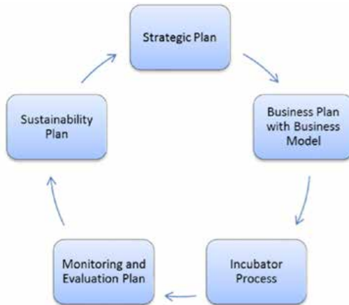
Diagram 1: Key component of ideation to implementation training

Fifteen organisations participated in the training for the final cohort of 2016/2017, including: Race Course PYC (Clarendon), The Jamaica Association of General Baptists (Clarendon), Beulah Church of God Seventh Day Evangelical Inc. Ltd (Clarendon), Mocho Citizens Association (Clarendon), Mighty Gully Sculptures (St. Catherine), Good Hope Partners (St. Andrew), East Kingston Society (St. Andrew), Barrett Town Police Youth Club (St. James), Lilliput Rovers Youth Club (St. James), Ramble Hill Citizens Association (St. James), Mt. Carey Citizens Association (St. James), Race Course CDC (Clarendon), Belle Plain Citizens Association (Clarendon), Brixton Hill CDC (Clarendon), Knollis Community Benevolent Society (St. Catherine).