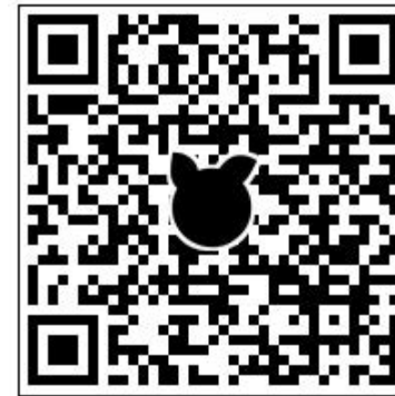
MSBM TUITION FEE US$

2. Scan the QR code below to pay in USD$: