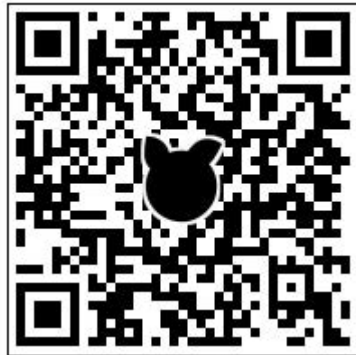
MSBM TUITION FEE J$

1. Scan the QR code below to pay in JMD$: