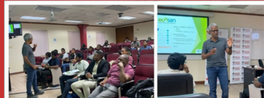
Vincent Hosang UWI Venture Competition Boot Camp