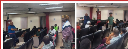
Vincent Hosang UWI Venture Competition Boot Camp

The UWI Vincent HoSang Venture Competition aims to propel ideas from student entrepreneurs into thriving businesses.