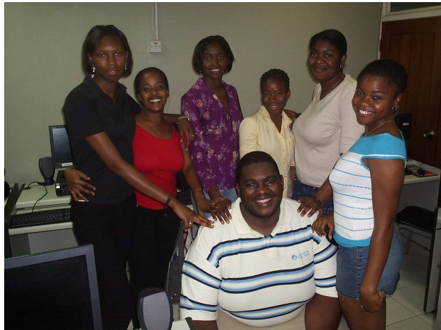
Photograph of final year students in 2005