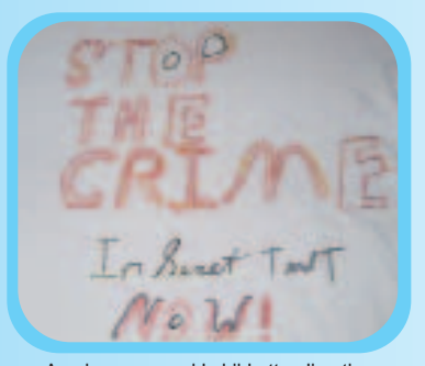
An eleven year-old child attending the camp, makes a plea to persons to stop the violence in Trinidad and Tobago.

Department of Sociology, Psychology and Social Work