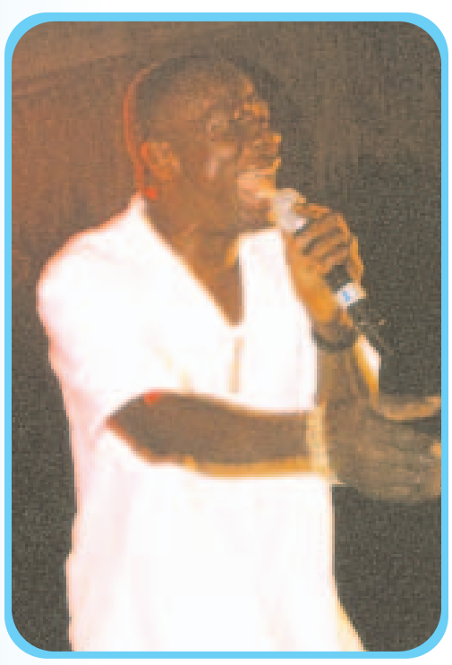
Leroy Sibbles - singer, arranger - one of the most important bass line creators in popular Jamaican Music.