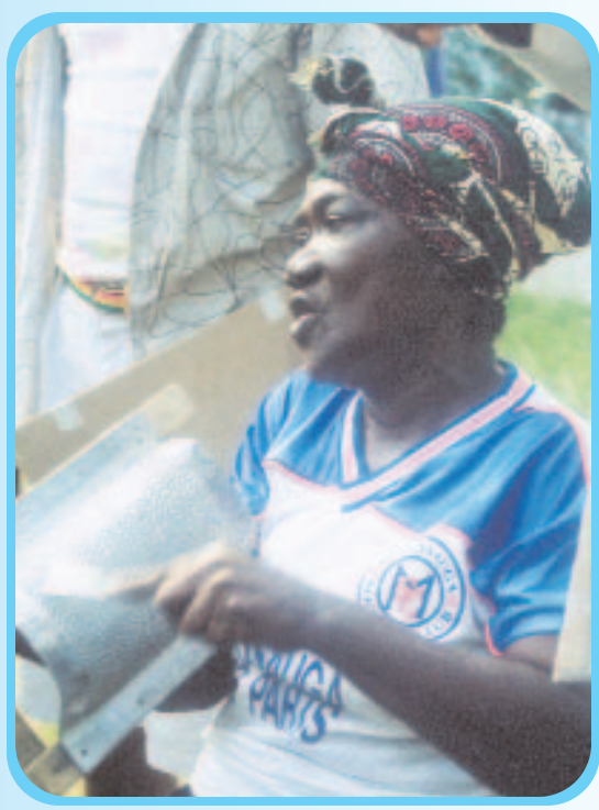
A traditional musician in the kumina trandition, St. Thomas.

One aspect of this research project included several interviews that were conducted with a wide range of participants in the making of this expression of Caribbean cultural identity, which makes the study essentially a reconstruction of the social history of Jamaica during the period, 1952 to 1972. The research also involved field work on various aspects of traditional Jamaican music such as Kumina, Revival, Mento and Gere. The study will document the contribution of the traditional music to the aesthetic foundations of popular Jamaican music.