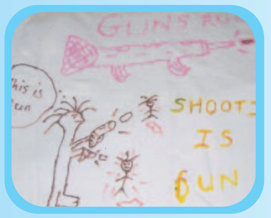
Drawing done by a 15 year-old adolescent attending the special camp in Trinidad and Tobago in August 2005, to express his views on the mindset of criminals in his community.