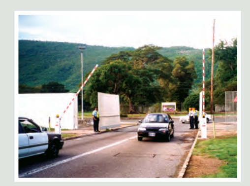
Members of the Campus Security team monitoring traffic through the UWI main gate

The University Bookshop established during the period a textbook grant of $60,000 to be distributed among six needy students. The grant is to be managed by the Office of Student Financing.