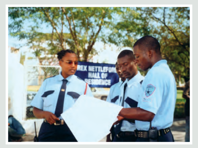
Members of the Campus Security team on location at the Rex Nettleford Hall