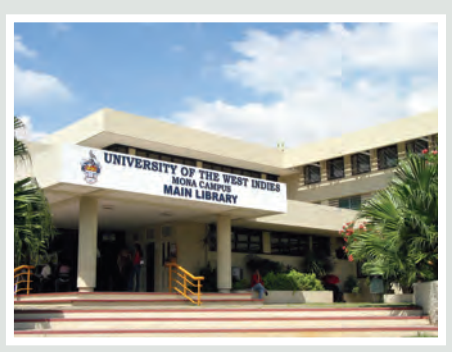
The UWI Main Library