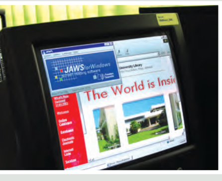
The Virtual Health Library accessed from the Library's webpage

As a result of increased interaction with faculty, the Library organised training sessions in Information Literacy for students at both the undergraduate and graduate levels. The Library also reached out to new students by holding interactive sessions with over 500 full-time students and over 300 part-time students. There were also 40 hour-long library orientation tours for the new students.