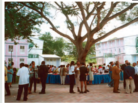
Persons in attendance at the official opening of the Rex Nettleford Hall