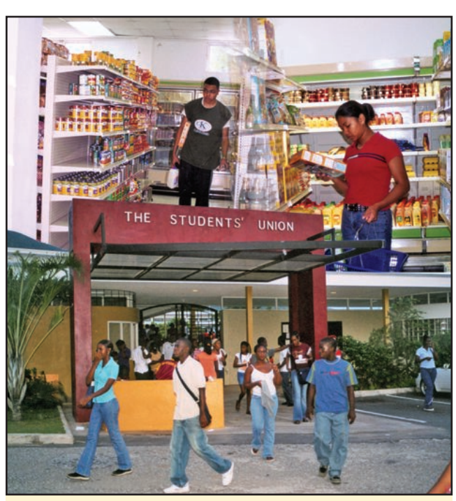
1. Students shopping at the new mini mart facility, which opened at the Students' Union complex.

The 2002/2003 period saw additional initiatives of the Business Development Office to introduce and evaluate the potential for introducing new income-generating concerns. It completed the commercial centre, and identified suitable tenants to operate the mix of businesses required, such as a mini mart, food outlet, unisex beauty salon and travel agency. During the year leases were signed with Hi-Lo Foods Ltd. to establish and operate the Mini Mart and with VIHOPE Ltd for the food outlet. The terms and conditions for the leas-