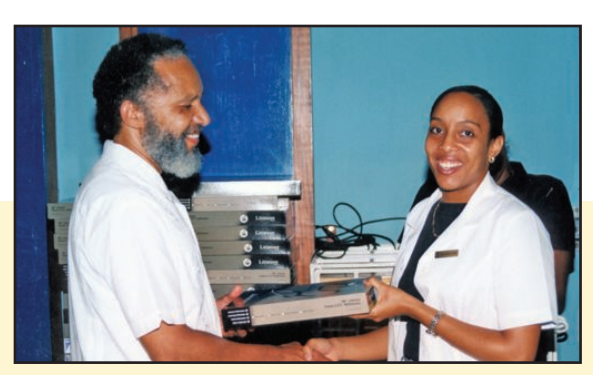
The Medical Alumni Association donates stethoscopes to medical students

It is well recognized worldwide that alumni support is critical to a university's long-term sustainability. Concerted effort was made during the academic period to strengthen alumni support. The UWI Alumni Association (UWIAA) set about updating alumni contact information; and establishing and making available through the UWIAA "Great Things for UWI" programme, an e-mail directory of alumni.