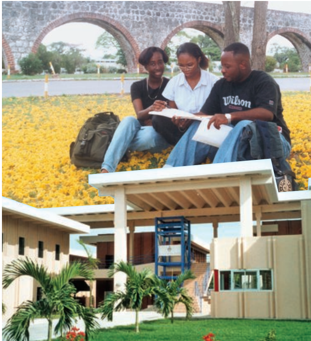
1. Students enjoying the cool of the poui tree.