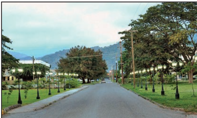
New lighting and a paved pathway leading from the entrance to the Campus by the Mona Post Office.

A number of initiatives were undertaken to enhance the accessibility, security and overall appeal of the Campus, all of which are intended to enhance the Campus' delivery of its academic programmes. These initiatives included electrical upgrading to buildings and residences, general refurbishing of student halls, and painting of, and repairs to furniture in the Chapel. An improved Students Union opened during the academic year and repairs were made to the roof of the Phillip Sherlock Centre for the Creative Arts. Most striking of these physical enhancements is the remodelling and upgrading of the "Post Office" gate, which increases the aesthetic appeal of the Campus and encourages access. A campus master plan was developed, which provides a framework for future development that includes an expanded pedestrian circulation system, an upgraded vehicular circulation system, a landscaping plan to provide a coherent and unifying element to the many different architectural styles, and more clearly defined and easily accessible walkways.