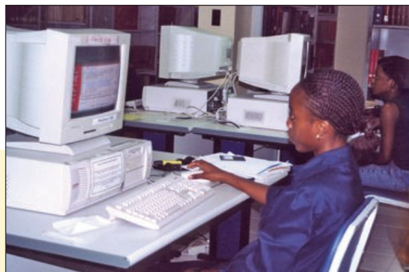
Students surfing the world wide web at the Mona Electronic Reference Information Centre (MERIC), Main Library

The Campus is close to achieving its goal of staff (administrative and academic) to computer ratio of 1:1. The ratio for student-accessible on-campus computers has been reduced from 60:1 in 2000/2001 to 35:1 in 2002/2003. The Campus’ strategic goal is 10:1 by year 2004-2005. Internet access is also similarly available. Computers have been placed in all strategic areas (labs, libraries, halls of residence, administrative offices) and are connected to the Campus Area Network (CAN).