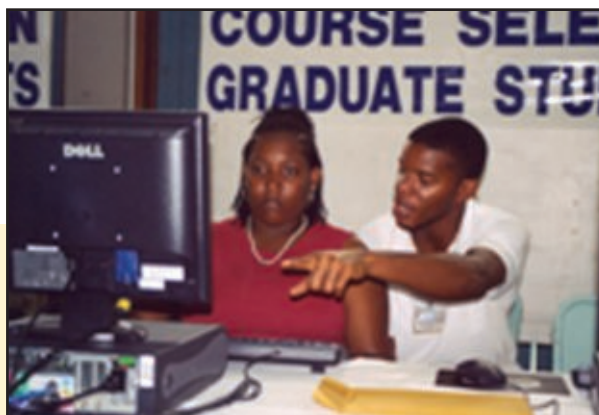
Graduate students doing course selection and completing registration online.

Ecosystem Management, the MSc in Plant Production and Protection and the MSc in Water Resources Management. Many of the new programmes are self-financing.