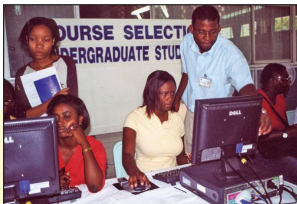
Undergraduate students doing course selection and completing registration online at one of many stations set up on the Campus.