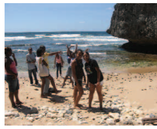
EC Trip -Fun Time at Maracas Bay, Trinidad

Non-academic enrichment initiatives seek to address the broadened social stratification of our 15,000 strong student population. This year we renewed our efforts to provide more students with opportunities to improve their "softer" skills and hands-on experience. We institutiona-