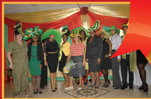
Graduate Studies & Research