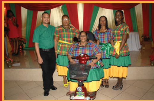
Records Management Office