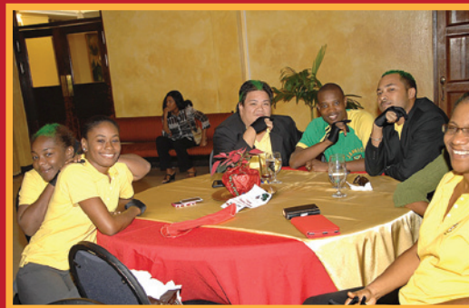
Student Records /Admissions