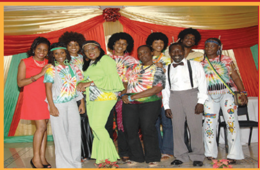
Marketing & Communications Office