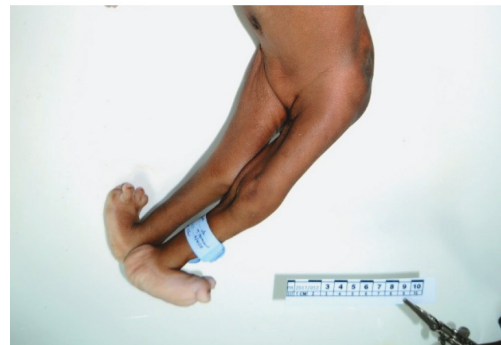
Fig. 3A: External autopsy photograph. Severe congenital arthrogryposis with joint deformities and marked muscle wasting.

shoulder, extended at the elbow, "frozen hips" and knees, bilaterally (Fig. 3A).