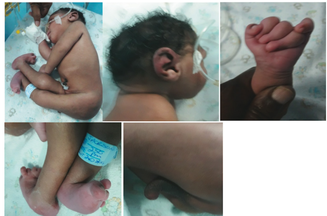
Fig. 2: Panels (2A, B, C, D, E)– show male newborn on day three of life with severe microcephaly, collapsed skull with prominent occiput and severe arthrogryposis, involving multiple joints, with dislocated knees and hips, prominent calcanei (rocker bottom feet), camptodactyly (permanently bent fingers, toes), clinodactyly (curved fingers and toes), chordee penis (penis curved downwards), bilateral cryptorchidism (undescended testes) and brachydactyly of the toes (shortened toes).