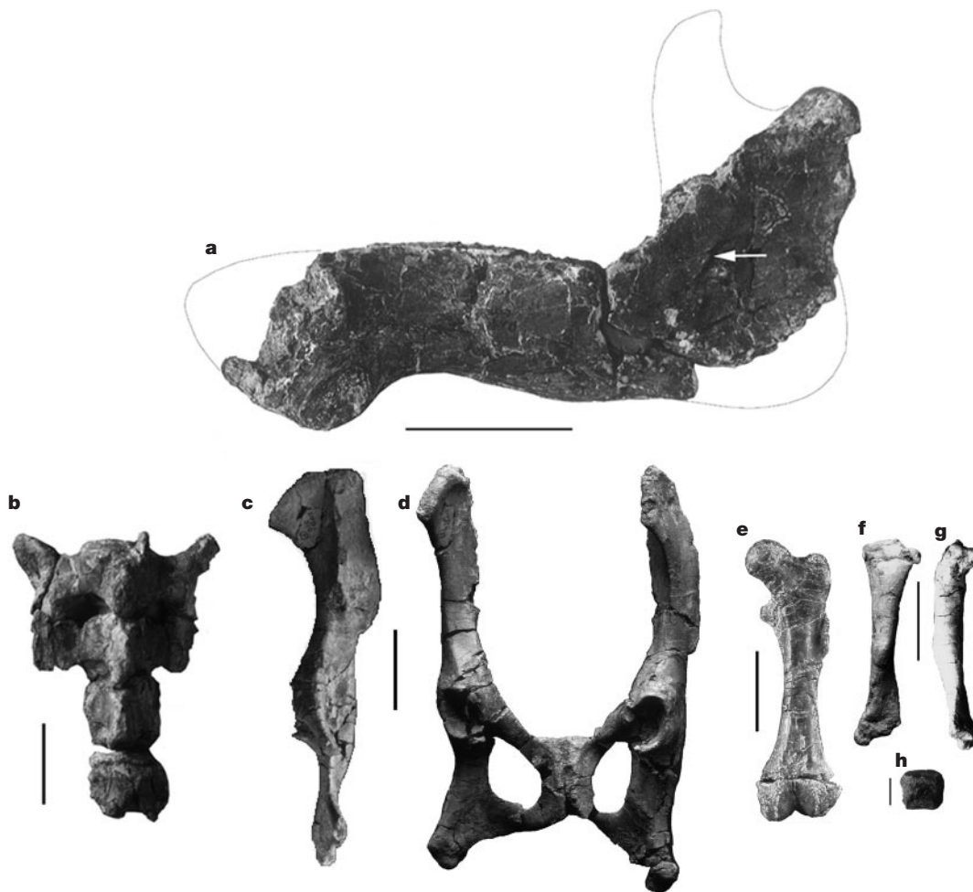
Figure 2 Pezosiren portelli . a , Partial right mandible (holotype, USNM 511925); medial view, showing location of small mandibular foramen (white arrow). Approximate outlines of restored broken portions are shown. b , Dorsal view of sacrum (USNM 517463); pleurapophyses are missing on S3–S4. c , Right innominate (USNM 517464); ventromedial view. d , Right and left innominates (USNM 517464); ventral view. The

atlas, fibula, most bones of the feet, and most caudal vertebrae) are not. The length of the tail, and the form and posture of the feet are partly conjectural.